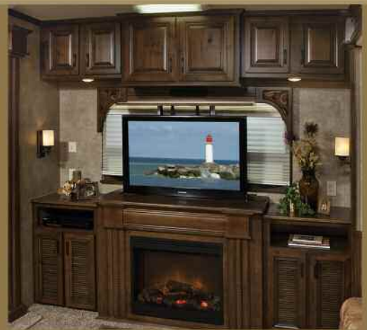
Premium Fifth Wheels