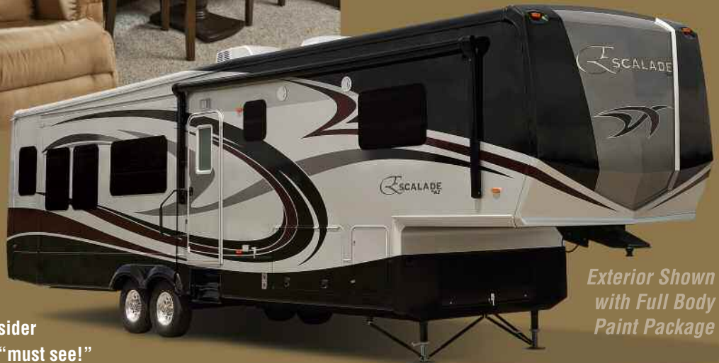
Exterior Shown with Full Body Paint Package

The rich woodtones and distinctive styling exhibit a touch of rustic charm you're going to love. Spacious and well designed, this model features the comforts of residential-style living and invites extended travel. Consider this elegant coach an excellent value and a "must see!"